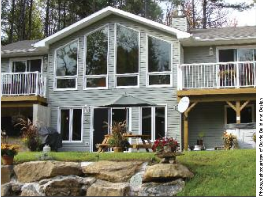
This Guildcrest manufactured modular home by Barrie Build and Design is practical with its walk-out basement design.

Though many people are building their retirement dream home, resale value is always a consideration when