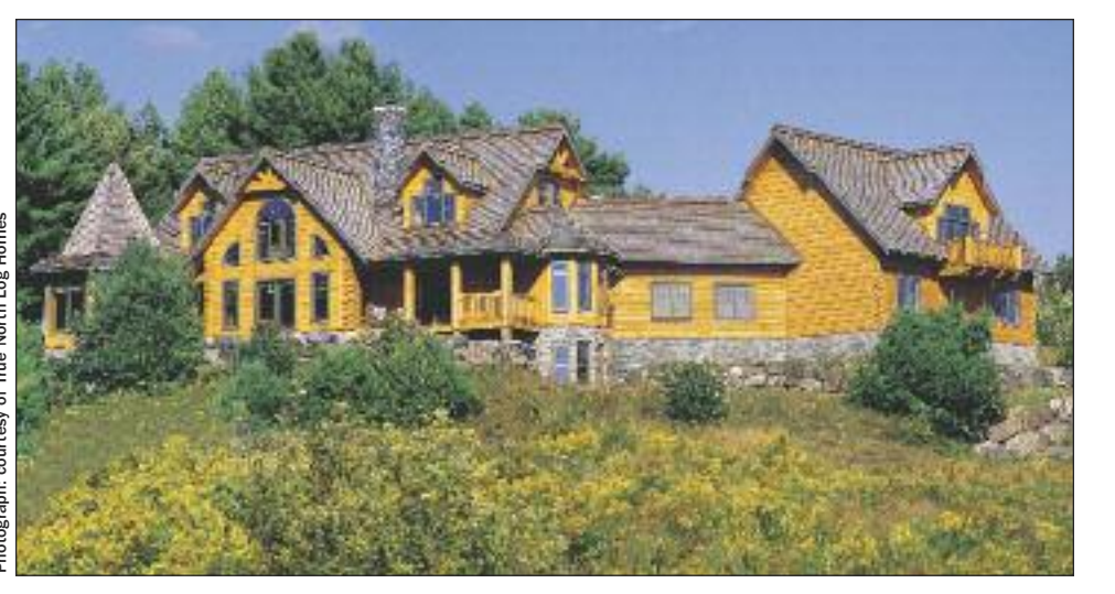
The Citadel III model by True North Log Homes boasts four bedrooms, three baths and a studio apartment with walk-out balcony.

1-888-842-3769 705-286-6730 705-766-9604 1053 Main St. Dorset algonquinprojects.com 12197 Hwy. 35 Minden