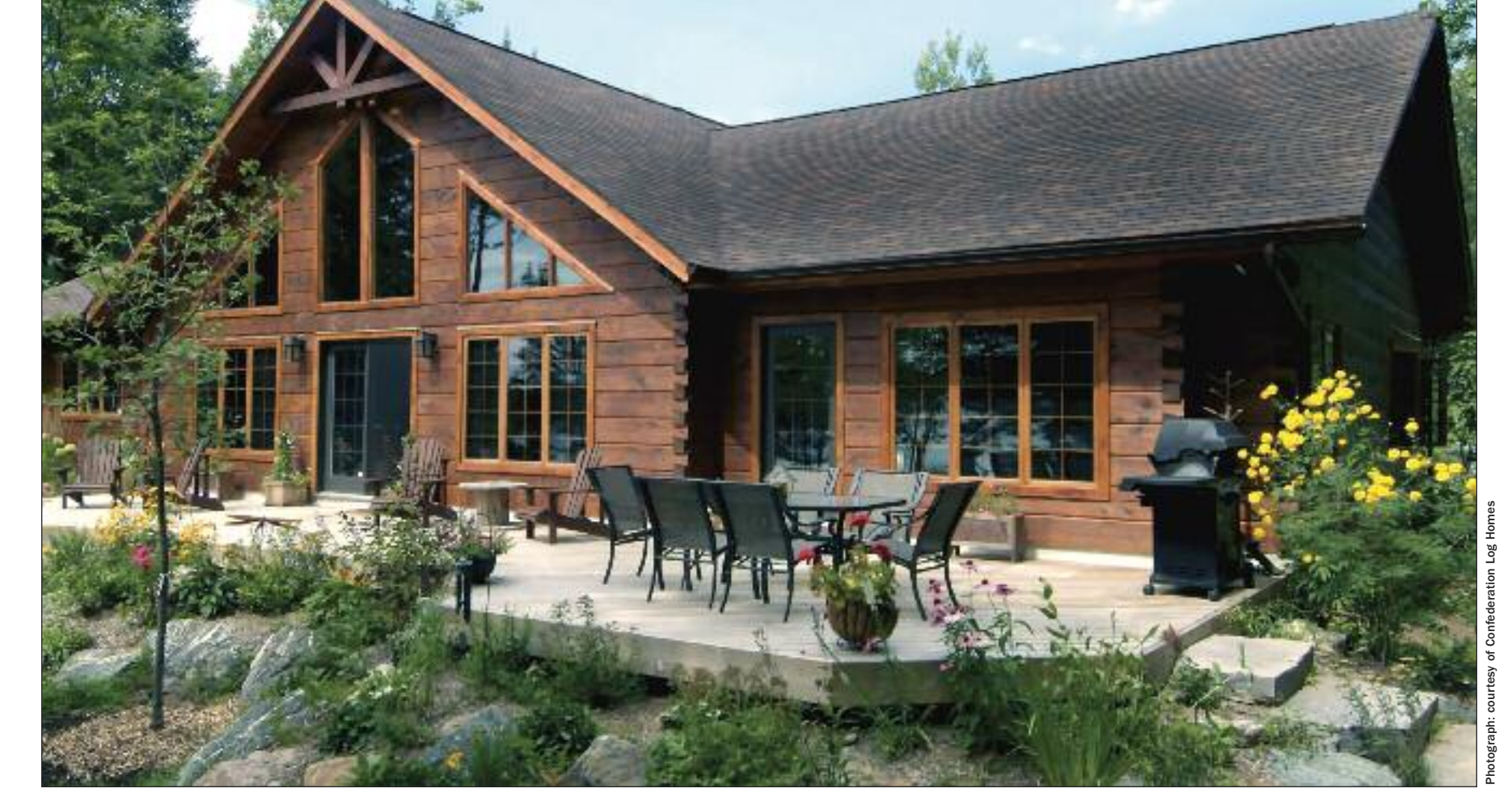
Confederation Log Homes produces pre-manufactured square-log and timber frame homes that are custom designed for the client.